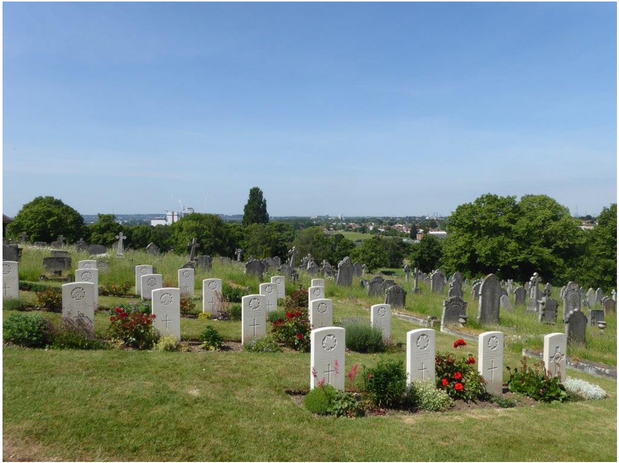
War Graves in Greenwich Cemetery