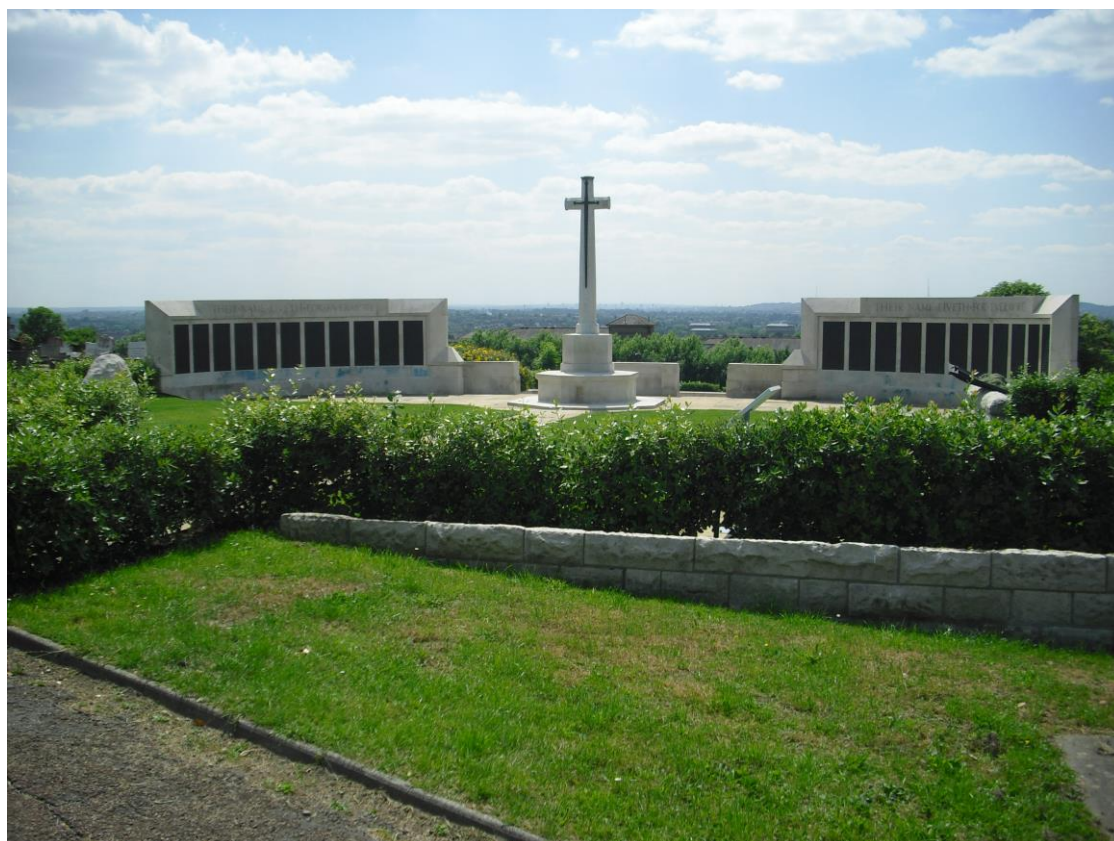
Cross of Sacrifice & Screen Walls