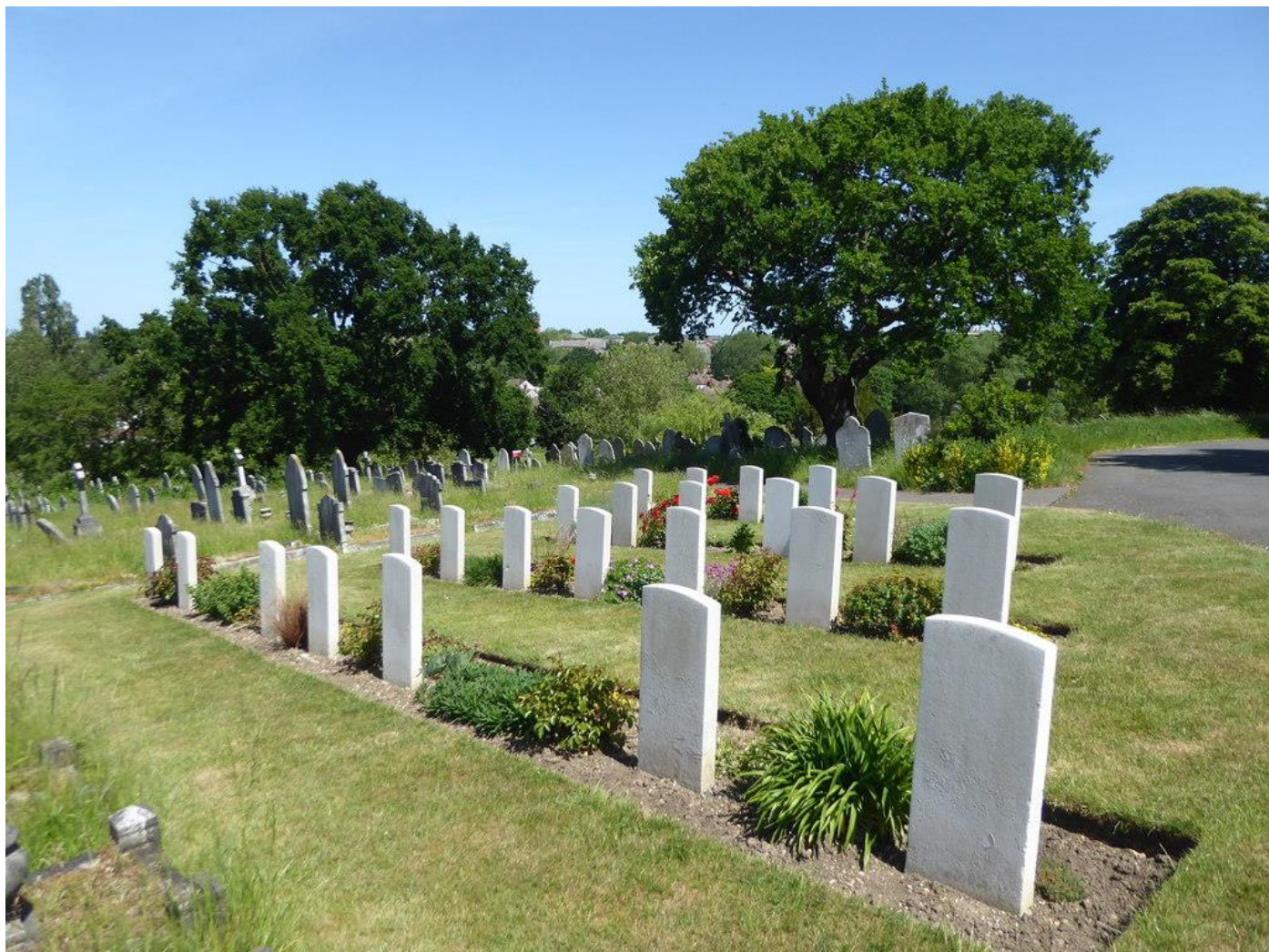
War Graves in Greenwich Cemetery